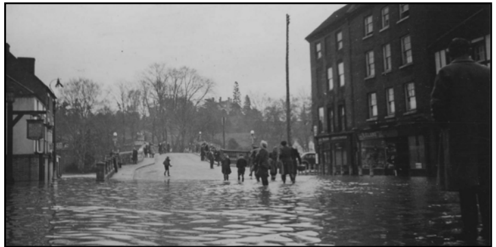
Load Street towards the bridge.