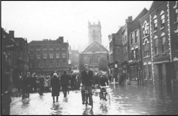
Load Street from the bridge in last century

Photos of the River Severn flooding in Bewdley before barriers were erected.