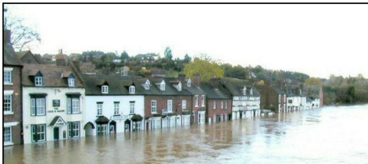
Severn Side North