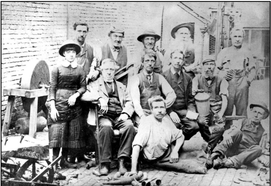
Humpherson's hornworks in the late 19th century.

G.J.Humpherson & Sons Horn Works, Bewdley was established in 1749. The business moved to Gloucester in 1912, where it took on the name of Abbey Horn Works. The